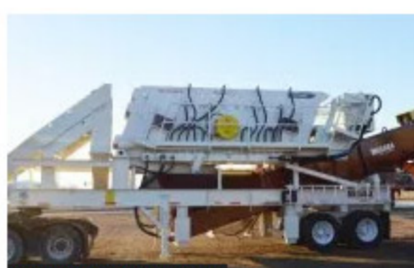
Classifying & Washing Masaba Introduces Single Screw Portable Wash Plant