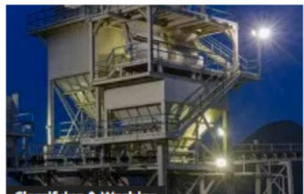
Classifying & Washing Van Tongeren's Breakthrough Dry Process Classifier Systems Separate Particles Without Water