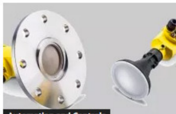
Automation and Controls VEGAPULS 69 Uses Dynamic Range for Difficult Media