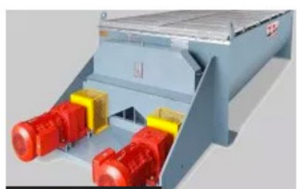
Classifying & Washing PHOENIX/KISA Logwashers