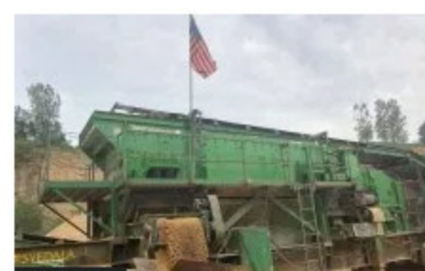
Screening McLanahan's H-Series MAX Screen